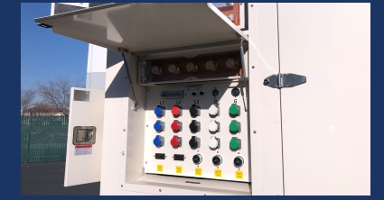
CUSTOMER CONNECTION CAM-LOK STANDARD