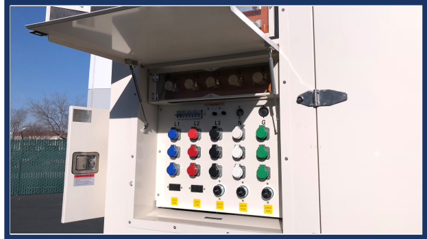
CUSTOMER CONNECTION PANEL