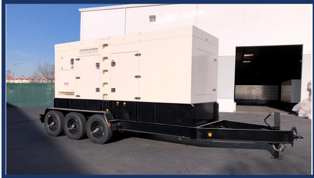
LARGE CAPACITY FUEL CELL

UQ-490: Standby Rating: 487kVA / 390kW Prime Rating: 443 kVA / 355 kW