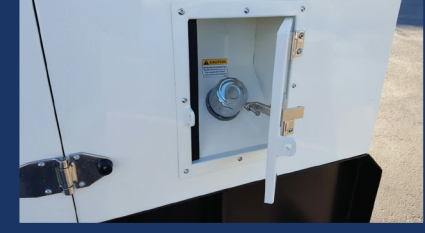
LOCKABLE EXTERNAL FUEL FILL