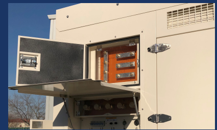
LINK BOARD VOLTAGE SELECTION