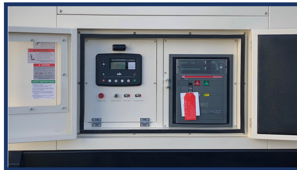
REAR CONTROL PANEL WITH MLCB